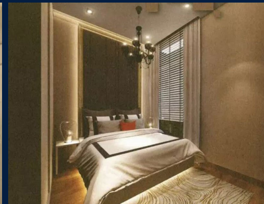
3 - Bedroom